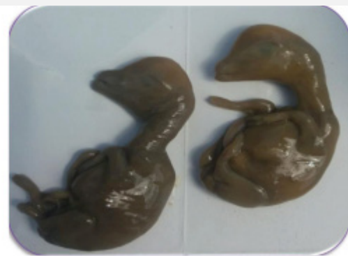
Figure 1: Aborted twin fetuses after dexamethasone injection.

The results of this study showed that the effect of dexamethasone on abortion in cows is a time-dependent effect. In other words, a pair of cows must reach a stage of growth and maturity that can convert the progesterone production line in the placenta to estrogen under the influence of dexamethasone. Contrary to previous studies [9] which believed that dexamethasone affects the placenta at 5 months of age, the results of this study showed that dexamethasone is around the third month or 90 days of age that affect the placental hormone production process and causes abortion.